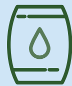
Rainwater Tank Harvesting

Capacity exists to further expand the solar power generation in the future.