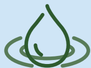
Water Sensitive Urban Design